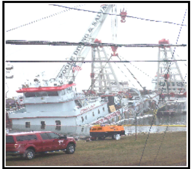
The Stephen L. Colby Sinking Near The LeClaire Levee

We wish both of these youth organizations the best of luck in these upcoming events.