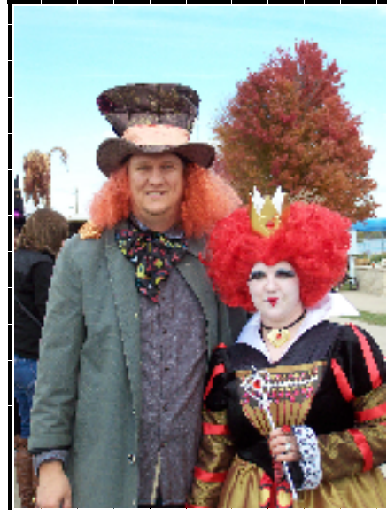
Where is Alice? ... When We Find Her... It's Off With Her Head!