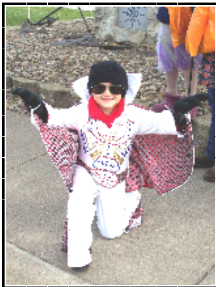
ELVIS WAS IN THE HOUSE !!!