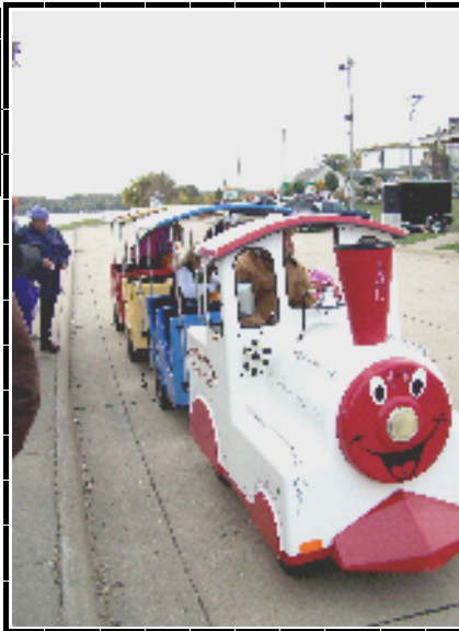
ALL ABOARD The Witches' Walk Express !

On the left, A Big Shark! And along side is another character, " Just Clowning Around ".... The Halloween Parade included everything imaginable!