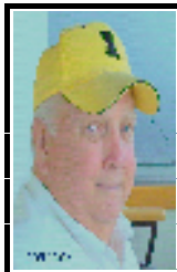
15th YEAR AS EDITOR

For Building Maintenance - Jeff # 340-2065